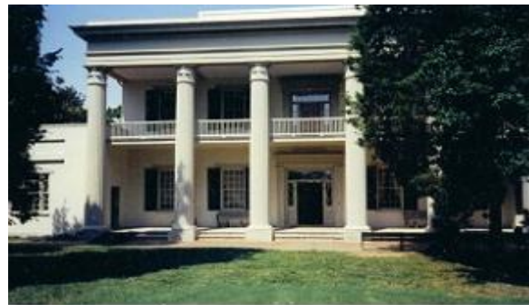
Home of President Andrew Jackson

7:00 a.m. Cont. Breakfast @ Fairfield Inn 9:00 – 11:30 a.m. Tour: The Hermitage