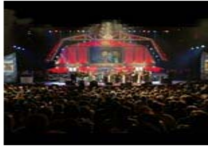
The Grand Ole Opry