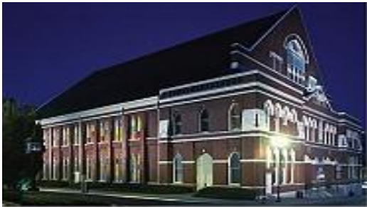
The Ryman Auditorium

12:00 – 1:00 p.m. Lunch: SoBro Grill @ CM Hall of Fame *Southern Style Smokehouse Buffet 1:00 – 2:00 p.m. Country Music Workshops Available *Sharing the Art of Songwriting--Create and Record a Country Song *Stories Behind the Songs--Private Session--“How Hits are Created” 2:00 – 3:00 p.m. Tour: Country Music Hall of Fame 3:15 – 4:15 p.m. “Star for a Day” Program Tour: RCA Studios *Show Choir Recording Session @ Elvis’ RCA Studio “B” 5:00 – 6:30 p.m. Dinner: Buca di Beppo—Italian 7:30 – 9:30 p.m. Show @ The Ryman Auditorium Or Grand Ole Opry 10:00 p.m. Return to Fairfield Inn