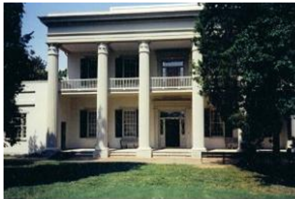
Home of President Andrew Jackson Show Choir Performance

Saturday, April 24: (B-L-D) 7:00 a.m. Cont. Breakfast @ Fairfield Inn 9:00 – 11:30 a.m. Tour: The Hermitage