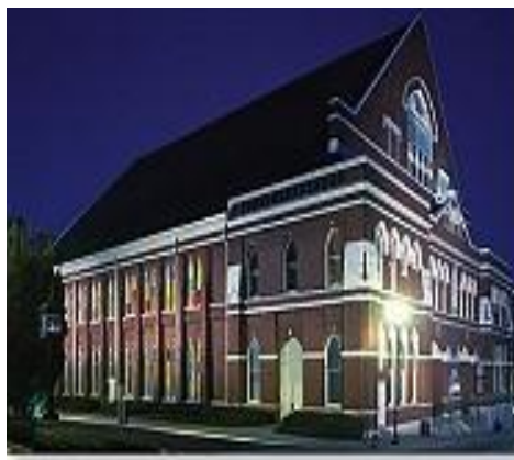
The Ryman Auditorium

Sunday, April 25: (B-L-D) 7:00 a.m. Cont. Breakfast @ Fairfield Inn 8:30 – 11:30 a.m. Step-on Guided Tour *Highlights of Nashville 12:00 – 2:00 p.m. Lunch @ Wildhorse Saloon *Country Line-Dance Lessons 2:00 – 3:00 p.m. Explore & Shop Downtown Nashville 3:15 p.m. Return to Hotel 6:00 – 9:00 p.m. General Jackson Cruise, Dinner & Show @ The Gazebo Entrance *Show Choir Performance Monday, April 26: (B) 6:30 a.m. Cont. Breakfast @ Fairfield Inn 7:30 a.m. Depart for Highlands HS 5:00 p.m.(Approx.) Arrival at Highlands HS